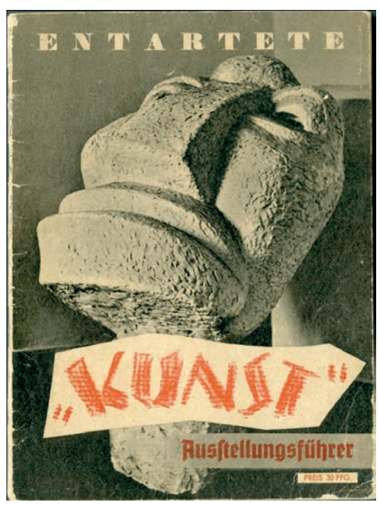
FIGURE 2. COVER OF THE 1937 DEGENERATE ART EXHIBITION CATALOGUE FEATURING OTTO FREUNDLICH'S 1912 SCULPTURE DER NEUE MENSCH. Copyright: Public domain / Wikimedia commons.

https://commons.wikimedia.org/wiki/ File:Entartete_%22KUNST%22_Ausstellungsführer_30_ Pfg._Degenerate_art_Exhibition_catalogue_front_ cover_1937_Nazi_Germany_Propaganda_Otto_ Freundlich_Der_neue_Mensch_(L%27Homme_ nouveau)_1912_No_known_copyright_ restrictions_17-20_(3).jpg