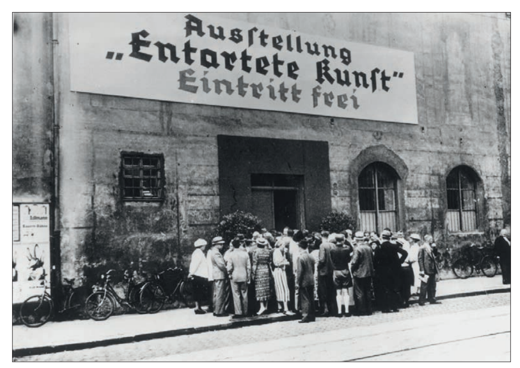
FIGURE 3. A CROWD GATHERING IN FRONT OF THE ENTRANCE OF THE DEGENERATE ART EXHIBITION.

The printed materials ensured the exhibition already began in public space, compounding the effect of immersion with posters and postcards that featured or imitated «degenerate» works of art (with the admonition Nachdruck verboten [reprinting prohibited] making paraphernalia even more salient).<sup>88</sup> Besides these ephemera, bodies were also bringing the lure of the exhibition to the street – with people crowding at the EKA entrance (Figure 3). Is there anything that makes us more eager to see than a crowd of people who themselves are trying to see something hidden from our view?