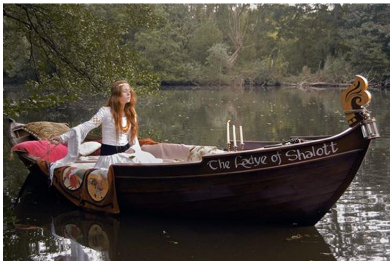
Fig. 5. "She loosed the chain, and down she lay; the broad stream bore her far away," The Lady of Shalott , dir. Nicole Loven, https://www.youtube.com/watch?v=7_djmlH_GMs&t=57s,7'52 ", @CrowsEyeProductions ( https://www.crowseye.co.uk/ )

Integrating these components into the film dramatization not only enhances the action with greater intricacy and profundity, but also provides a light-hearted yet perceptive examination of the interrelationships among literature, art, and history. It enables spectators to fully engage with the world of the Pre-Raphaelites and Tennyson, blurring the boundaries between fantasy and reality in a creatively captivating way. The primary objective of this conversion, spanning from poem to image to cinema, is to aptly communicate the fundamental nature of the poem. The objective is to elicit identical feelings, themes, and narrative components that contribute to the captivating nature of "The Lady of Shalott" as a literary masterpiece. The adaptation of the paintings of Waterhouse in the Pre-Raphaelite tradition is influenced by the importance of detail, emotion, and narrative coherence (fig. 5). The process of converting Tennyson's poetry into an image and then into a film is a creative expedition that encompasses condensation, analysis, and augmentation. The similarity to John William Waterhouse's artworks indicates a strong adherence to the Pre-Raphaelite style and a sincere effort to visually depict the core of the poetry. This adaptation aims to revitalise a timeless literary masterpiece by providing audiences with a new viewpoint, while staying true to the poem's fundamental themes and emotions.