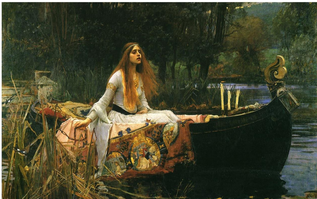
Figure 2. John Williams Waterhouse: I Am Half-Sick of Shadows, Said the Lady of Shalott (1888), Tate Britain, London.

And down the river's dim expanse Like some bold seer in a trance, Seeing all his own mischance With glassy countenance Did she look to Camelot. And at the closing of the day She loosed the chain, and down she lay; The broad stream bore her far away, The Lady of Shalott (Tennyson, 1974: 20)