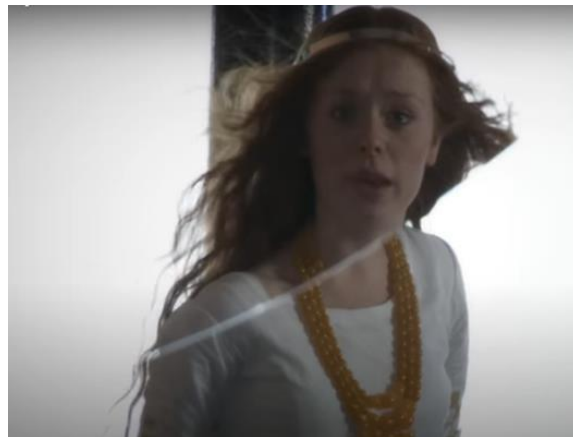
Figure 4. "The curse is upon me," The Lady of Shalott , dir. Nicole Loven, https://www.youtube.com/watch?v=7_djmlH_GMs&t=57s , 6'53", @CrowsEyeProductions ( https://www.crowseye.co.uk/ )

Transforming the imagery derived from the poem and translating it into a cinematic form is an inherent evolution within the artistic endeavour. The video enables dynamic storytelling with a sequence of mobile visuals, auditory elements, and spoken exchanges. It possesses the capacity to enhance the storyline by exploring character motivations, emotions, and relationships in a more profound manner. While the original image portrays a singular moment, the cinematic adaptation can offer a more expansive framework, enhancing the viewer's comprehension of the poem's motifs and characters. This truth enhances the genuineness and richness of the poem. On the LizzieSiddal.com website, Stephanie Chatfield quotes a member of the production team: