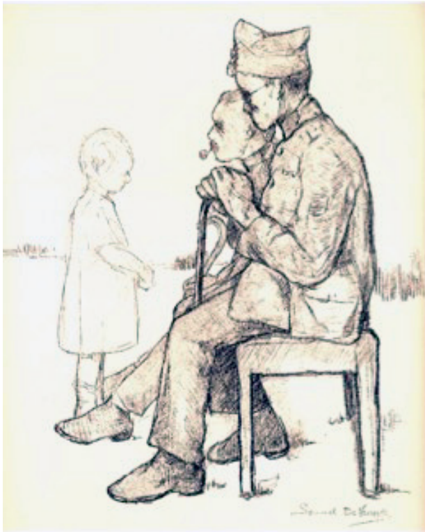
Image 6. Sketch 8 of Samuel de Vriendt's sketches – La toute petite amie/Het vriendinnetje/ Making friends

The war-blinded soldiers were seen as heroes, albeit as vulnerable heroes who, without professional care and re-education, were doomed to lead lives full of difficulty and suffering. Specific measures were taken with regard to them from the beginning of the Great War. Initially, war-blinded soldiers were sent to the Saint-Victor hospice in Amiens. It was only later that they were sent to Port-Villez, where the majority of physically disabled soldiers were brought for retraining. From official documents pertaining to the transfer of war-blinded soldiers, it appears that this happened because the advance of German troops meant that the situation in Amiens was becoming too dangerous. 34 However, it can be inferred from a document in the Royal Museum of War and the Armed