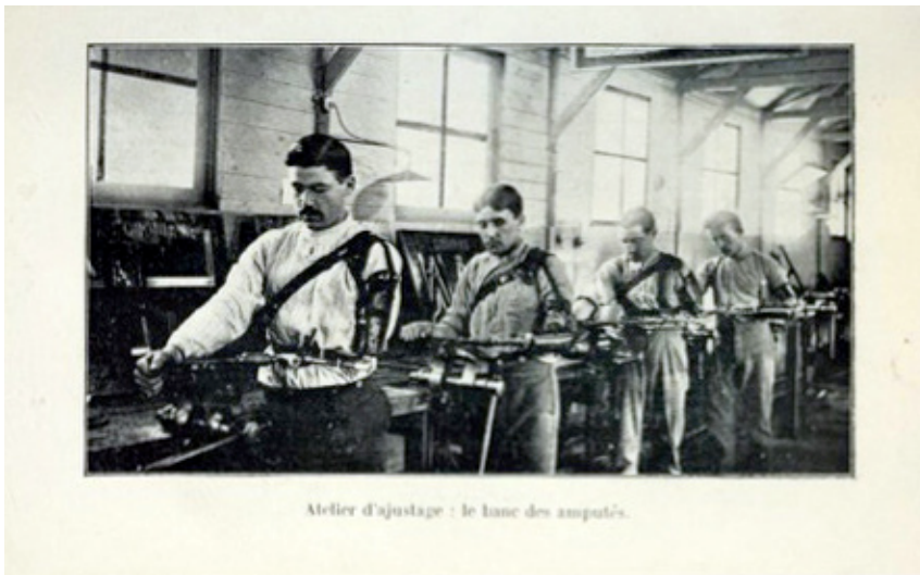
Image 3. Disabled soldiers with a work-prosthesis in an adjustment workshop at Port-Villez, 1917.

because one man may have succeeded in using an artificial arm, it does not follow that every man who has lost an arm, if given this apparatus, will be able to employ it for any trade he may wish to practice. The truth is quite different. These perfected arms are not only very costly, but too delicate and intricate to use working in a shop. Moreover very few men are dexterous enough to manipulate these arms properly. [...] In most cases it would be much better to re-educate the man as he is, with the limbs that he still possesses, and to choose a profession adapted to his physical limitations. 21