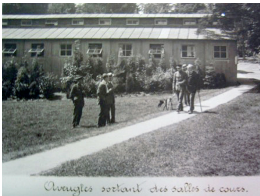
Image 7. Aveugles sortant des salles des cours [The blind leaving the classrooms]